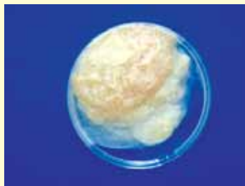
Vaginal mucus discharge containing \geq 50\% purulent material, usually white or yellow, but occasionally sanguineous.