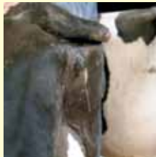
Vaginal discharge in the affected cow

The presence of a whitish yellow muco-purulent vaginal discharge is the main clinical sign. Volume of discharge increases at estrus. Cows rarely show systemic illness. On rectal examination thick uterine wall with doughy feel will be noticed.