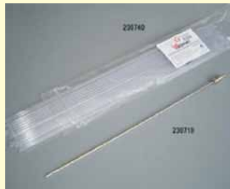
Uterine biopsy catheter

Relatively easy and safe procedure for the practicing veterinarian to perform. Its use in conjunction with a detailed history, rectal and vaginal examinations and microbial cultures can lead to a more accurate prognosis of difficult breeders and greater therapeutic efficiency. Biopsy lesions heal rapidly and haemorrhages are of little or no clinical significance. Biopsy specimen should be sufficient size (4 x 6 mm). Specimens should be taken from both the uterine horns and body due to variability of pathology in each section. Albuchin's uterine biopsy catheter is used to obtain in vivo uterine endometrial samples.