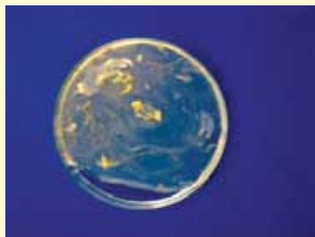
Vaginal mucus containing flecks of white or off-white pus